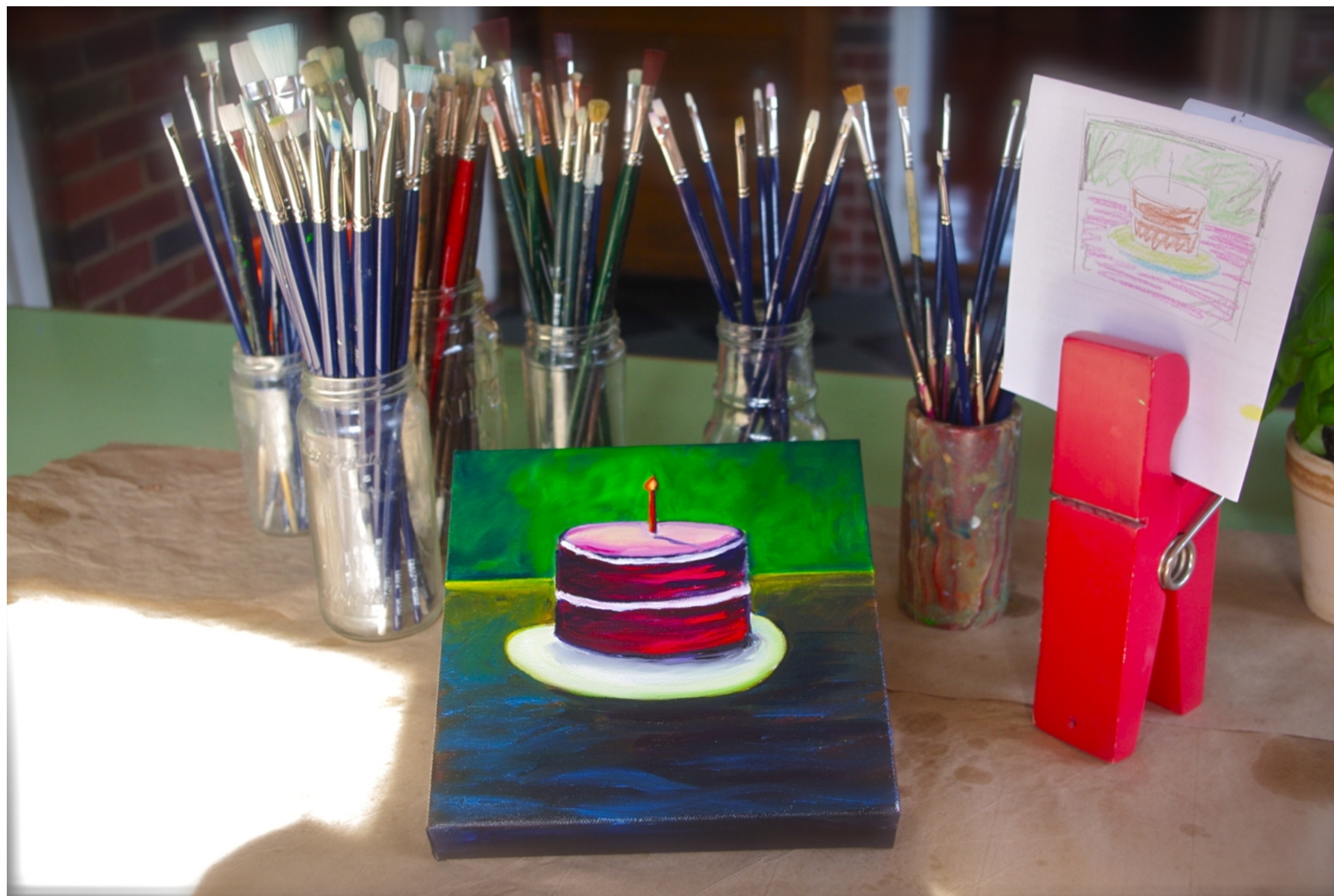
“PEACE ON EARTH” • 8 inch x 8” original oil painting • ©2017 Marie Scott