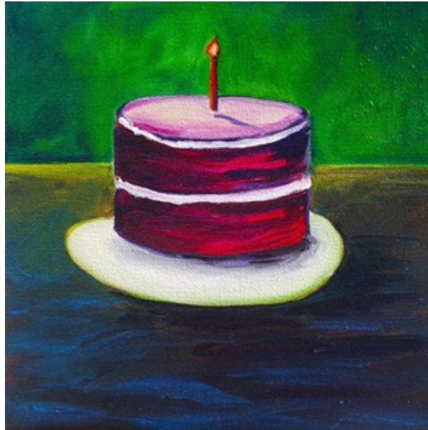
“PEACE ON EARTH” • 8 inch x 8” original oil painting • ©2017 Marie Scott